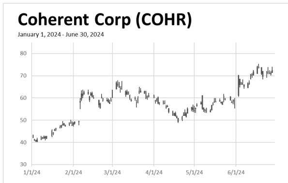
Coherent Corp (COHR) chart courtesy of FactSet.

Coherent Corp manufactures optical transceivers used to improve connection speeds between servers within datacenters. Strength in datacenter demand has been the driver behind strong results for the company, with earnings buoyed by demand for an upgrade from 400G to 800G transceivers to support AI.